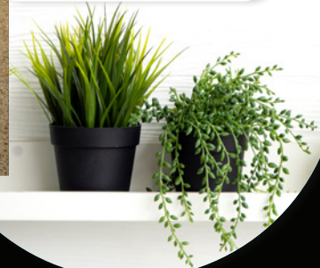
Haymes Paint Moon & Stars